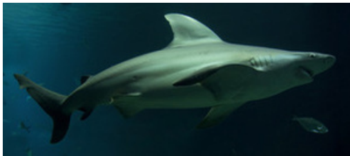
Sandbar Shark

The Discovery Channel launched the very popular “Shark Week” in July of 1988. The name of the first special? “Caged in Fear”. Hard to get around the fear mongering when the word is in the title itself!